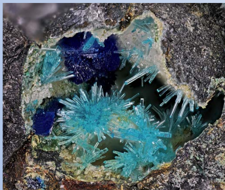
Caledonite, Meadowfoot Smelter

The Society Annual General Meeting will then be followed in the evening by an online mineral auction before returning to our virtual pubs for more socialising.