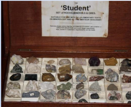
Gregory Bottley Ltd student collection