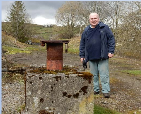
Rookhope Borehole