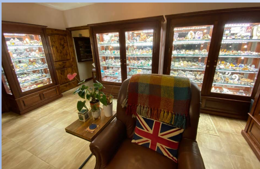
A view of the British Room