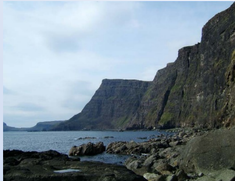
Moonen Bay