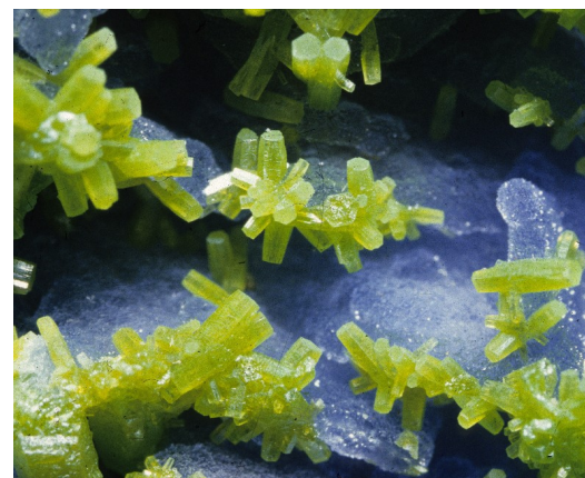
Green pyromorphite on blue plumbogummite Roughton Gill Mine, Caldbeck Fells, Cumbria.

The Russell Society publishes a Journal and a Newsletter, both of which are free to members. The Journal of the Russell Society contains peer-reviewed papers, reports, reviews and brief notes on topographical mineralogy and related subjects that are of interest to our members. The Newsletter contains reports of the indoor and outdoor activities of the Society and includes articles on minerals and mineralogical sites.